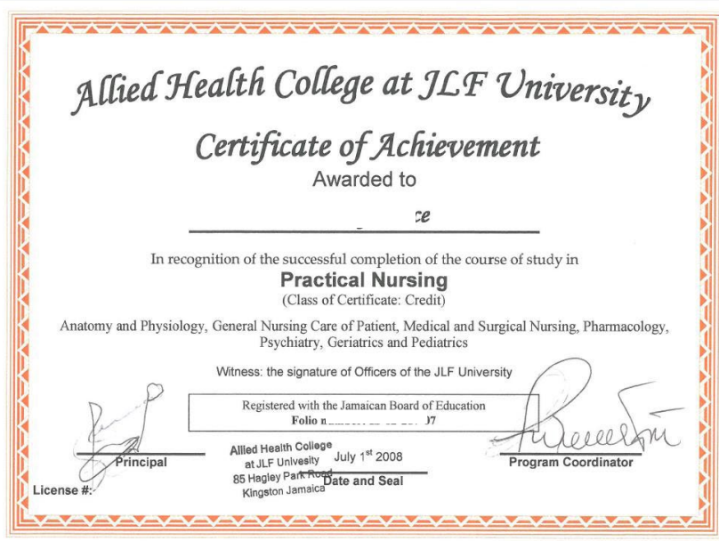
Figure 4: Practical Nursing Certificate from JLF University Allied Health College, which was prosecuted in the state of Florida in 2011

Figure 4 above shows a practical nursing certificate from Allied Health College at JLF University. JLF University, which has affiliated locations in Florida, Haiti and Jamaica, was sued by Florida Attorney General Pam Bondi for defrauding students in 2011. The following year, the university and its affiliates were required to pay $469,000 in restitution and an additional $67,000 in civil penalties 7 . The institution's website and the transcript for the above qualification together claim accreditation by Accrediting Commission International (ACI), the Association of Distance Learning Programs (ADLP), and the United States Distance Learning Association (USDLA). However, all three entities are accreditation mills.